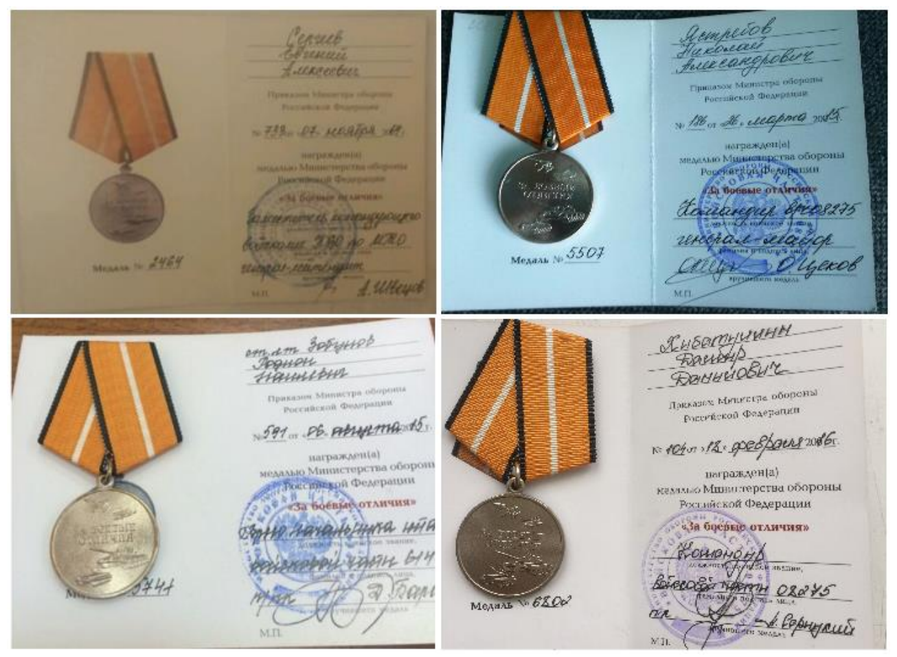
Figure 2: Medal "For Distinction in Combat", examples of award documents, top left: medal number 2464, top right: medal number 5507, bottom left: medal number 5741, bottom right: 6802, source: own research, @Askai707 and InformNapalm.

medal is excluded from the analysis. It is not possible to clearly identify the reason of this anomaly. Furthermore, three medals have only incomplete information because the exact date cannot be determined with the available imagery. In case of medal 3261 and 3380, both are excluded from the following analysis because enough information is available in this period. In case of medal 6076, the 15.09.2015 is assumed as award date in the following.