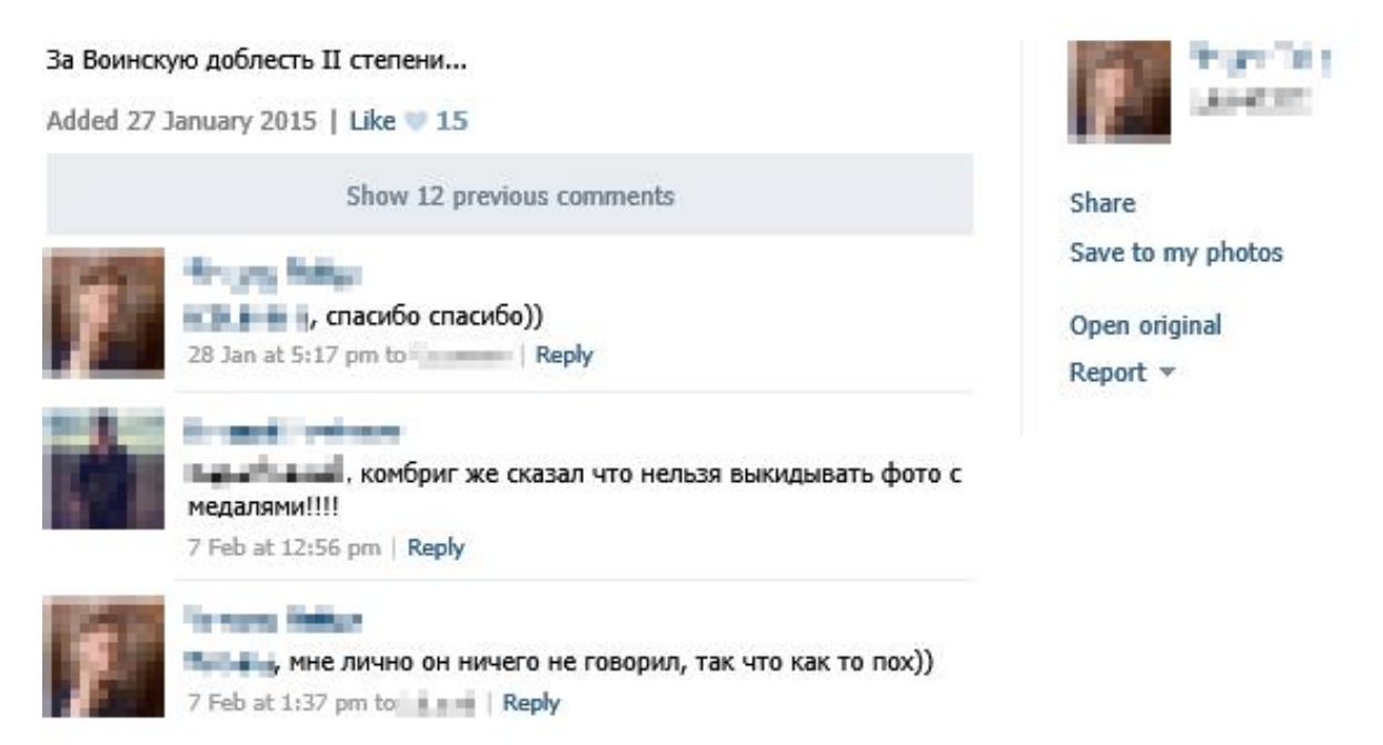
Figure 1: Discussion between two supposed Russian servicemen on VK. The depicted medal in the image is "For Military Valour" (2nd Class), the supporting text states the medal type. The discussion in the comment section below the image can be translated as "Thank you, Thank you:):)", "..., the commander of the brigade forbade uploading photos with medals!!!", "..., he didn't say this to me personally so I don't give a shit:):)". Names are censored. Archived version of the conversation available.